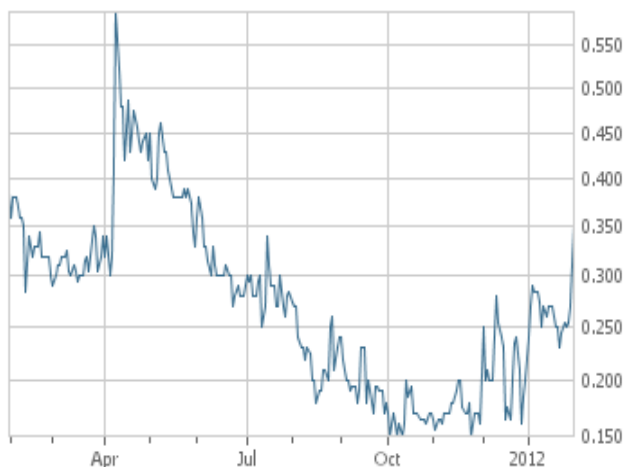
Shoal Point Energy Ltd (CNSX : C.SHP)

SHOAL POINT (CNQ:SHP) $0.35 +0.08 CGX ENERGY (V-OYL) $1.48 +0.02